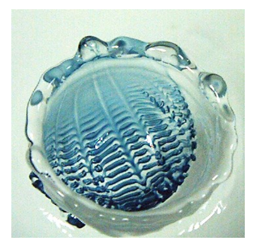
Regular flow structure of compound drop impact with water (Fluid Dynamics, 2024)